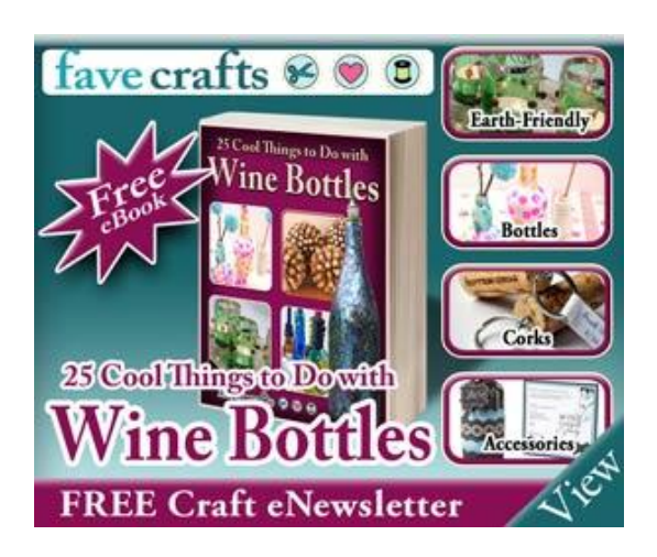
25 Cool Things to Do with Wine Bottles Free eBook